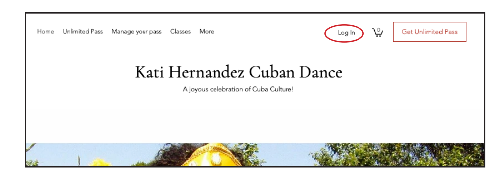
Step 2 Log In with your email.